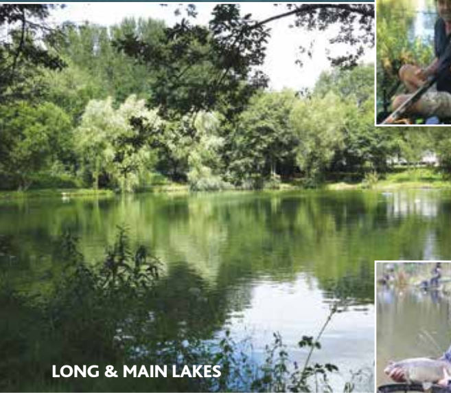
LONG & MAIN LAKES

Long Lake and Main Lake join to provide three acres with a total of 57 pegs stocked with Mirror, Common, Leather, Crucian, Ghost Carp, Roach, Rudd, Tench, Goldfish and Golden Orfe. In 2019 we also stocked the lake with Barbel and F1's