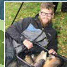
Unhooking mats provided