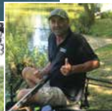
On site bailiff